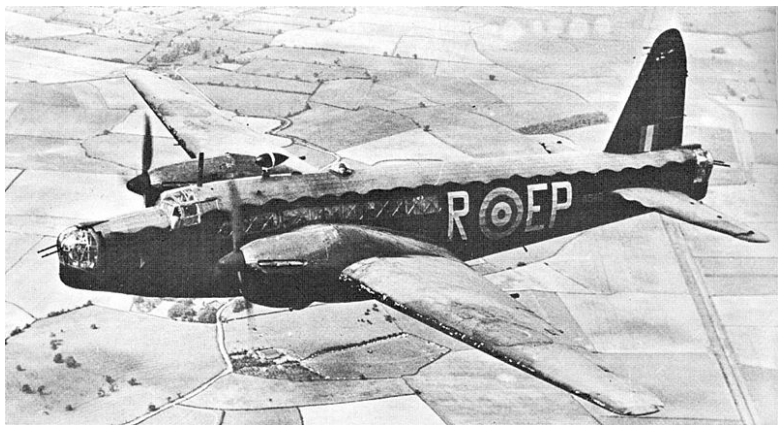
The Mk. 2 Vickers Wellington: geodetic sub-structure

In the 1930s, aircraft structures were becoming increasingly complicated and less amenable to solution by traditional hand calculation techniques.