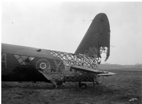
Battle damage in the tail of a Wellington Bomber

The geodetic skeleton of the Wellington bomber allowed it to sustain an incredible amount of battle damage.